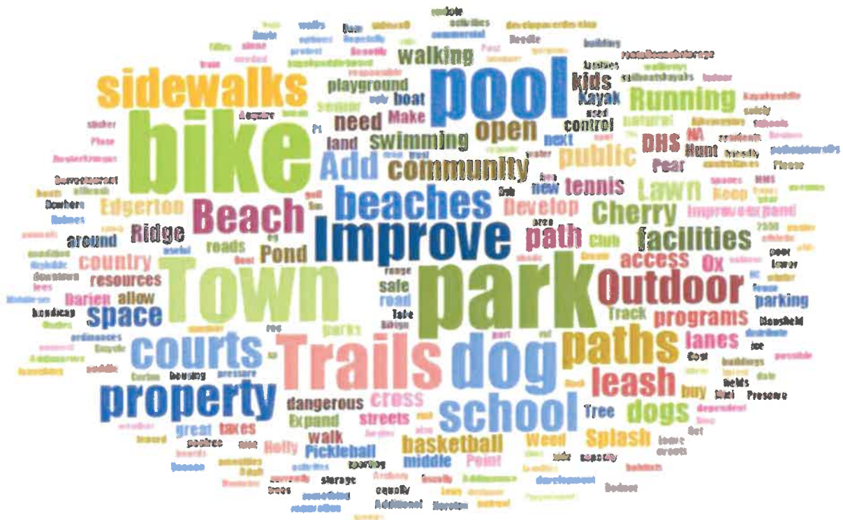
Word cloud based on 121 comments; invitation sample respondents only